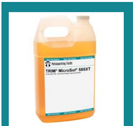
1-gallon jug SKU: MS585XT-1G UPC-12: 641238065838