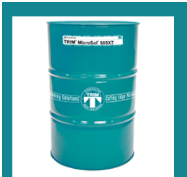
54-gallon drum SKU: MS585XT-54G UPC-12: 641238065814