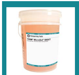
5-gallon pail SKU: MS585XT-5G UPC-12: 641238065821