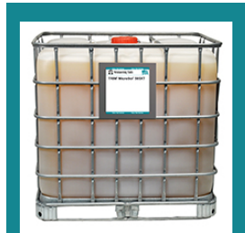
270-gallon tote SKU: MS585XT-270G UPC-12: 641238065852